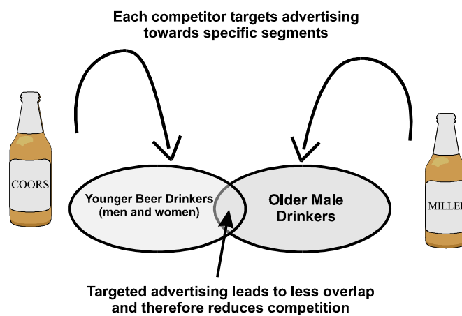
Figure 2 Targeted Media Buying in the Beer Market

This reduces price competition for two reasons. First, when a smaller fraction of the total market is informed about both brands (and willing to drink either product), less price comparisons are made. This reduces the incentive of the firms to reduce price. Second, targeted advertising means that consumers who have a strong pre-disposition to a firm's product are targeted by that firm. After seeing the advertising, these